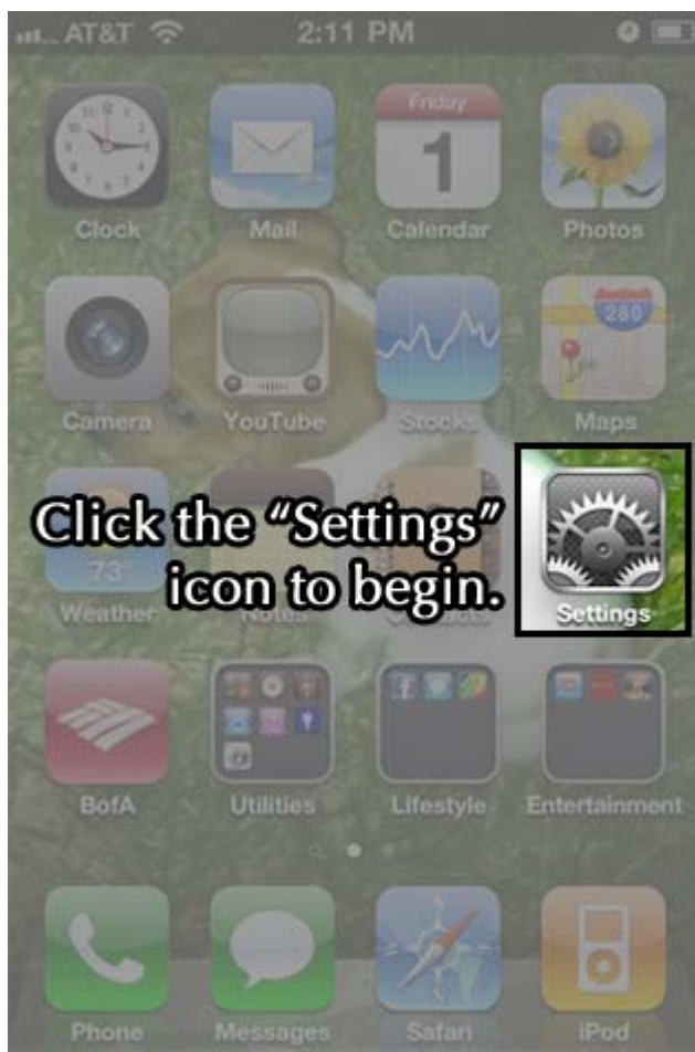
Figure 1: Click "Settings" to begin.

Next, tap Mail, Contacts, Calendars, see Figure 2: