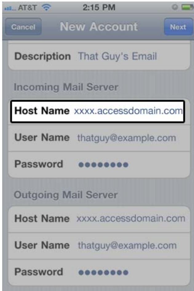
Figure 8: (mt) recommends using your mail access domain .